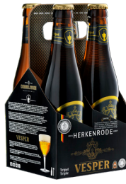
4 Pack Basket