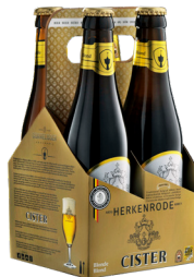
4 Pack Basket