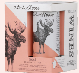
4 PACK - 250 ML CANS