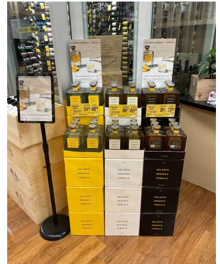
LUXURY DISPLAY, CARDBOARD DISPLAY, STANDING DISPLAY