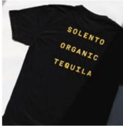
T-SHIRTS S, M, L, XL