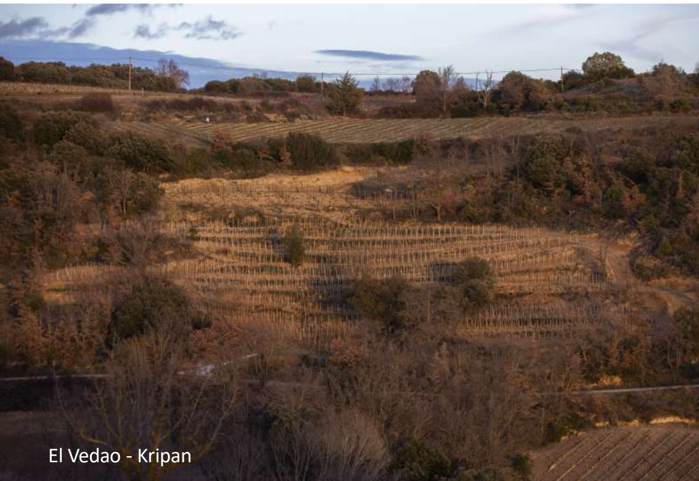
El Vedao - Kripan

In addition to rescuing small, old parcels, energy is invested in restoring historic terraces and planting varieties that add freshness such as Graciano, Garnacha tinto and blanco, Maturana tinta, and other white varieties.