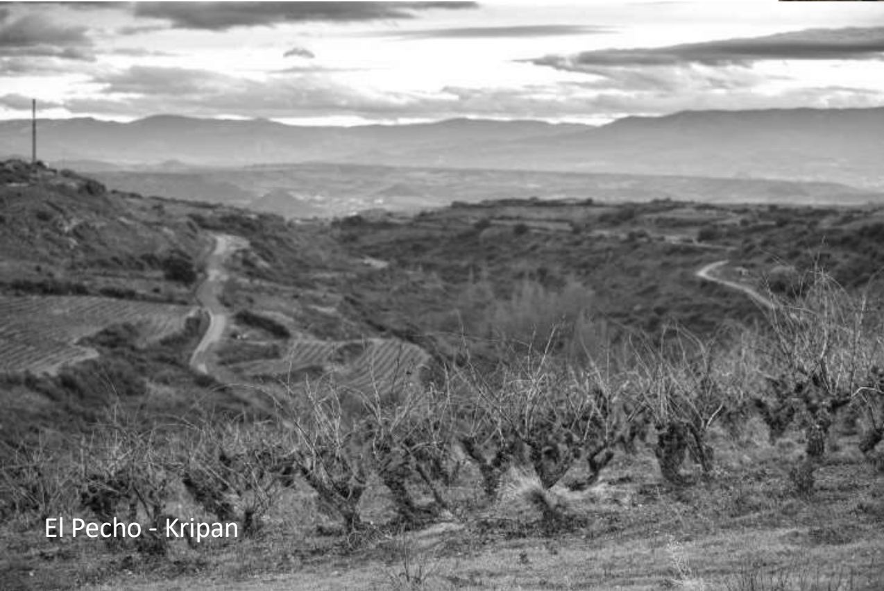
El Pecho - Kripan