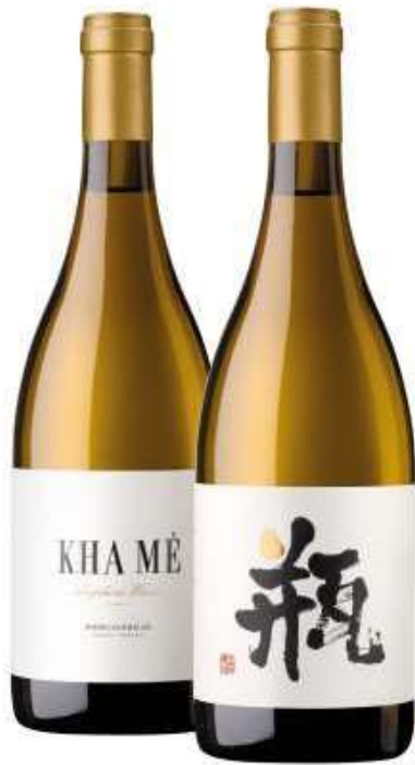
Garnacha Blanca Amphora