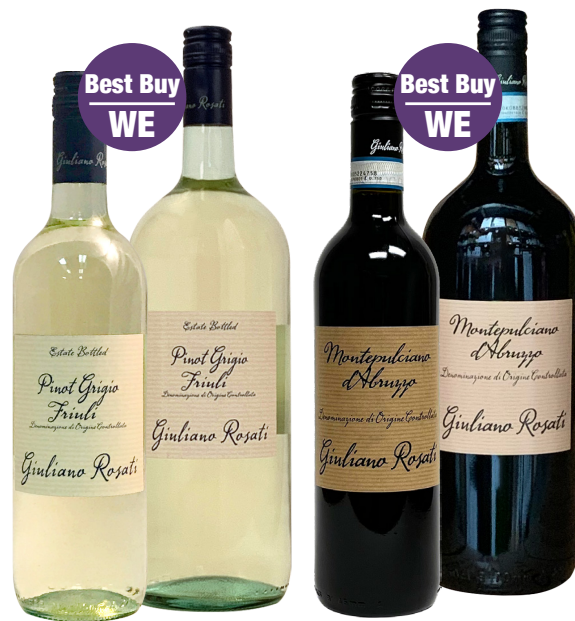
Montepulciano d'Abruzzo 750 ML X 12 & 1.5L X 6

“This Amarone greets the senses with inviting aromas of warmed plums, black cherries, sweet spice, violets and tobacco leaves. On the well-balanced palate, lush fruit harmonizes with vibrant acidity, while savory and earthy elements add depth and nuance, finishing with elegant tannins.” – Wine Enthusiast