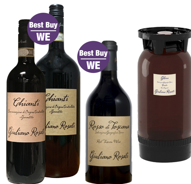
Chianti 750 ML X 12 & 1.5L X 6

“The intensely earthy, umami nose features aromas of soil, mushrooms, pepper and balsamic, but fruit notes of black cherries and dark berries provide balance while preserving a feeling of depth. The earth and black cherry tones headline the palate, before a bitter, slightly spicy finish.” – Wine Enthusiast