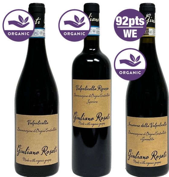
Valpolicella 750 ML X 12

A blend of Corvina, Rondinella, and Corvinone with no oak aging... this luminous ruby gem has fragrant cherry and violet notes. Fruity and refreshing on the palate with subtle mineral impressions. The ultimate crowd pleaser.